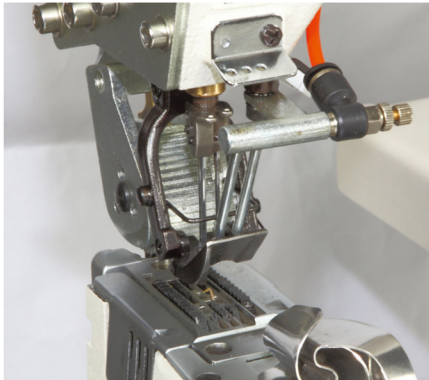
机针冷却装置 Needle cooling device