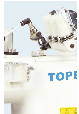
自动加油 Automatic refueling