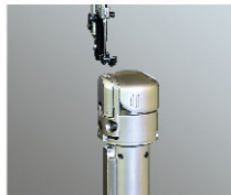
TPB-8365-R (右梭) TPB-8365-R (Right shuttle)